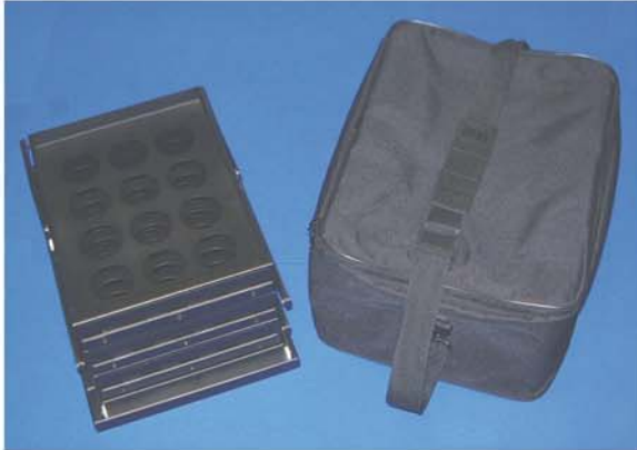
kit includes : a4 zedup & carry case

Caution: Ensure fingers are kept clear of folding mechanism when opening and closing this unit