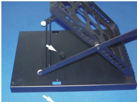
Locate both tray supports into the base cutouts