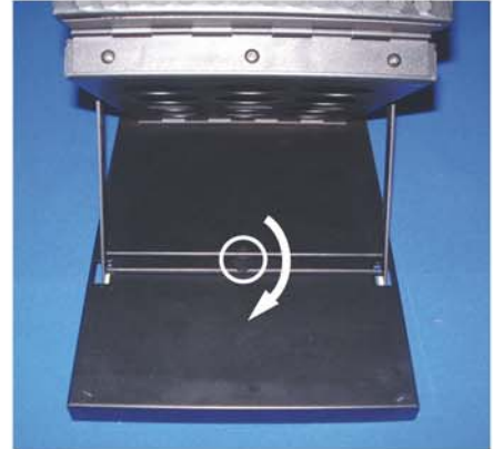
Rotate locking tab over the horizontal bar to lock the base into place