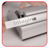
Add your own branding if required

*Graphic tension may be re-applied or added to by turning the ratchet tensioner clockwise; 6 clicks of the ratchet tensioner eq the banner stand spring. (NB Units are supplied pre-tensioned)