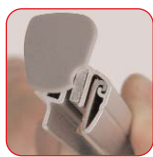
Universal grippa/adhesive Top rail