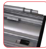
Integral Pole Storage